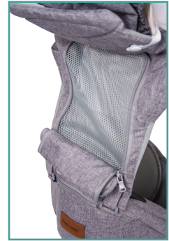
Pull down Breathable Mesh Window