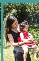
Hipseat Forward Facing