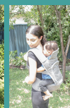
Hip Seat Carrier Back Carrier