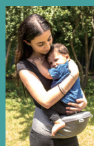
Hipseat Rear Facing