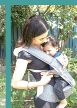
Hip Seat Carrier Rearward Facing