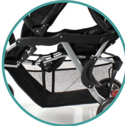
Large storage Basket