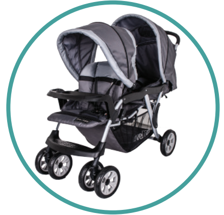
For Toddlers and Newborns