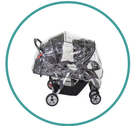
With Rain Cover (Sold Separately)