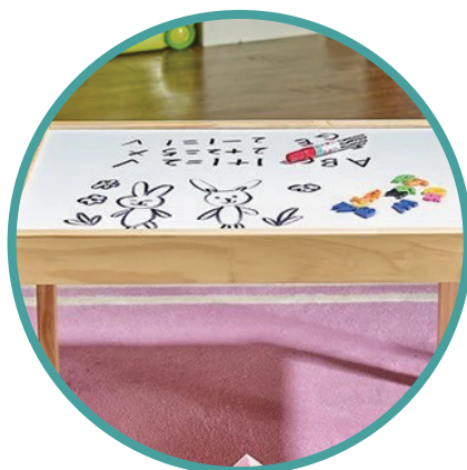
dry erase table top