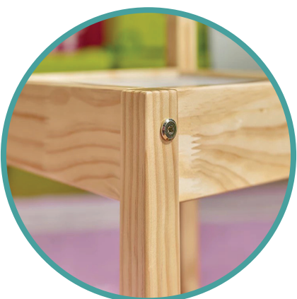
Rounded edges for safety