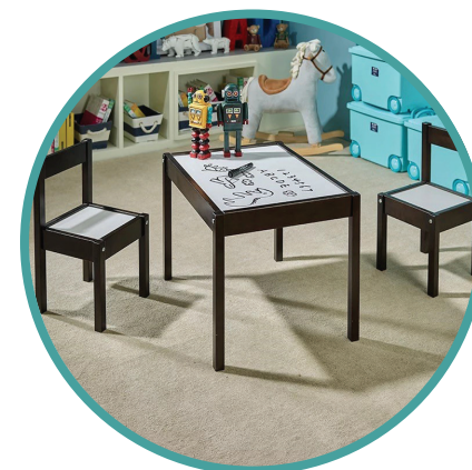
2 chairs and table included