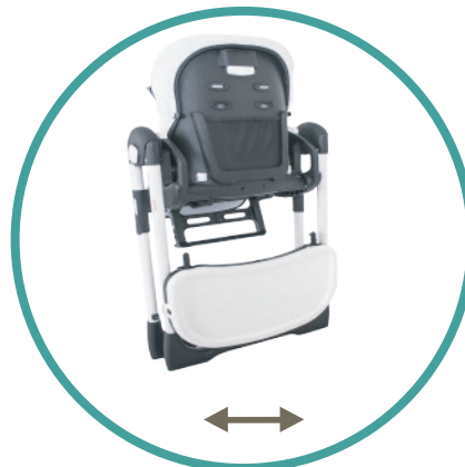
Compact Fold and tray can be stored on back leg