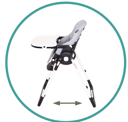
Reclines 5 positions