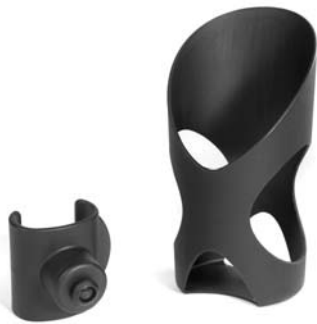
cupholder - igo