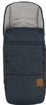
footmuff - industrial rock