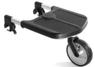
step-up board igo/evo