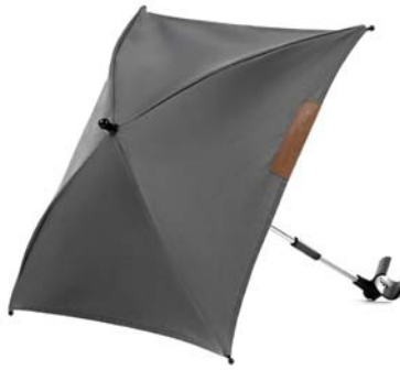
parasol - igo