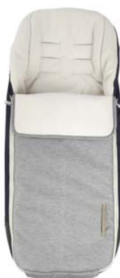
footmuff - pure fog