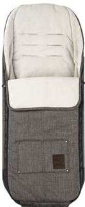
footmuff - farmer earth