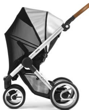
uv cover seat - evo