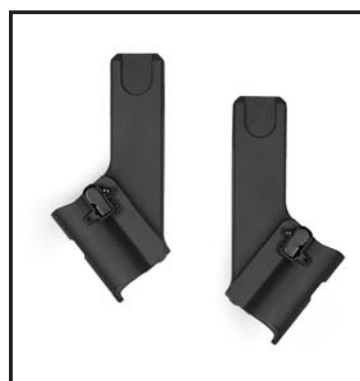
Maxi Cosi Adapters