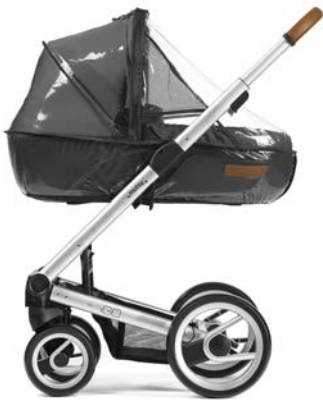
raincover carry cot - igo