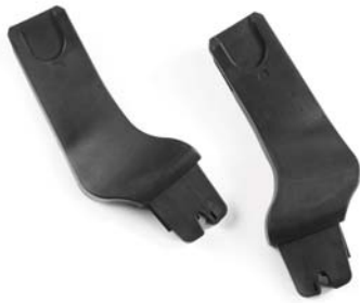
maxi cosi adapters - evo