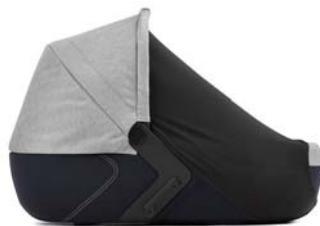
uv cover cot - igo