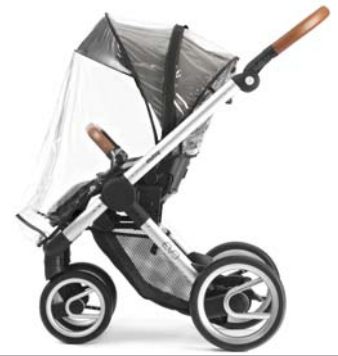
raincover seat - evo