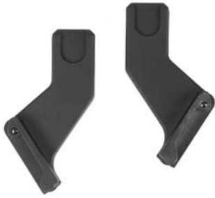
maxi cosi adapters - igo