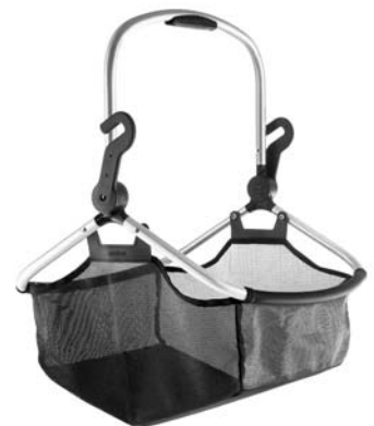
shopping bag - igo