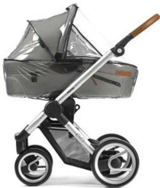
raincover carry cot - evo