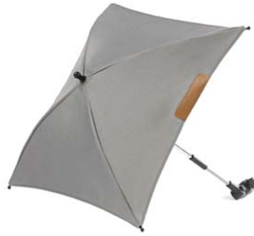
parasol - evo