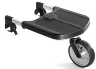
step-up board igo/evo