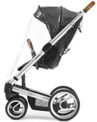
raincover seat - igo