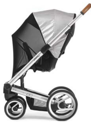
uv cover seat - igo