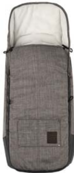
footmuff - farmer earth