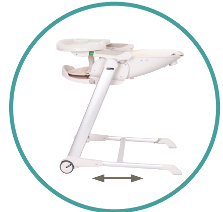
Reclines 4 positions 150 degrees