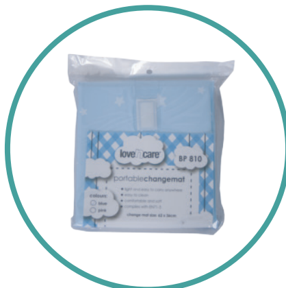
Easy to hang packaging