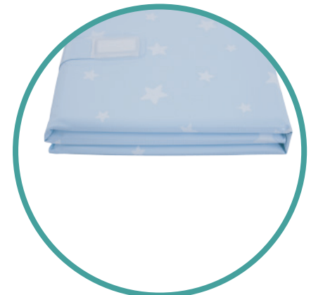
compact when folded