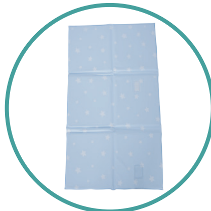
Star Design on back