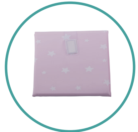
light and easy to carry