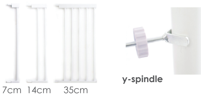
7cm 14cm 35cm