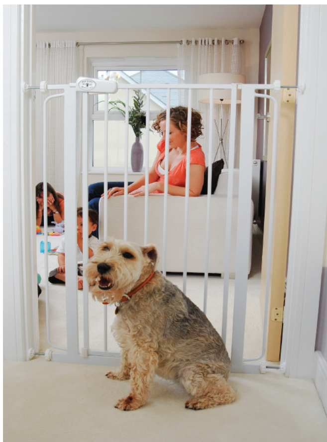
child and pet gate Gate