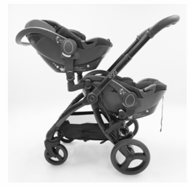
egg tandem car seats