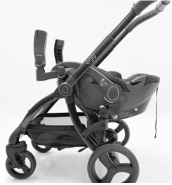
egg car seat in the lower position