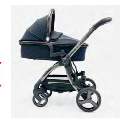
DO NOT USE: Tandem with carrycot in upper position only