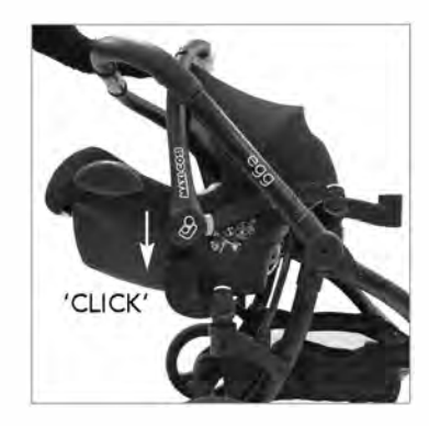
Fitting other recommended car seat.