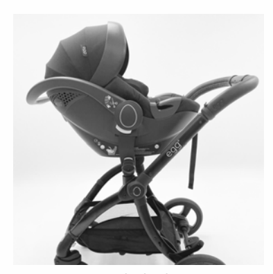
egg car seat locked in position.

WARNING: Ensure the car seat is securely locked into place by gently pulling the car seat upwards.