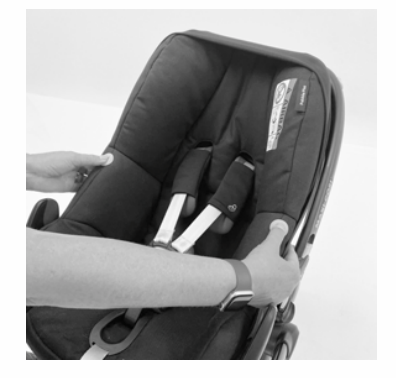
Removing a car seat with button release.

Note: Always fit the lower car seat first, parent facing. Always fit the upper car seat parent facing.