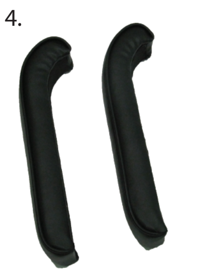
WHEN YOU OPEN YOUR GLIDER CARTON PLEASE ENSURE YOU HAVE ALL THE ITEMS: