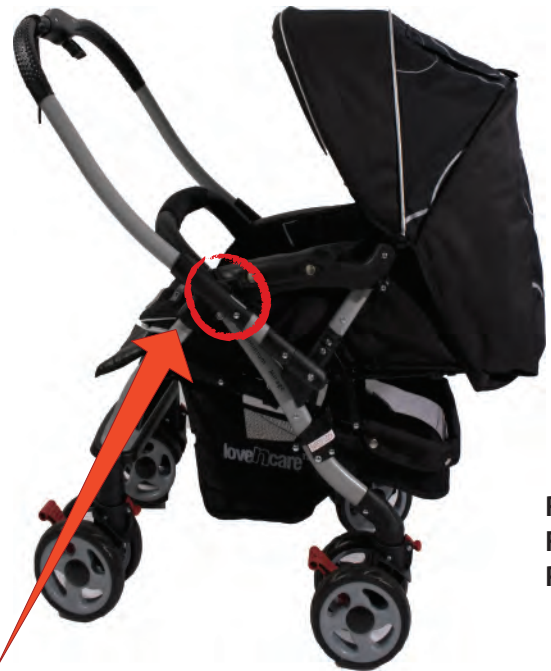
REAR FACING POSITION