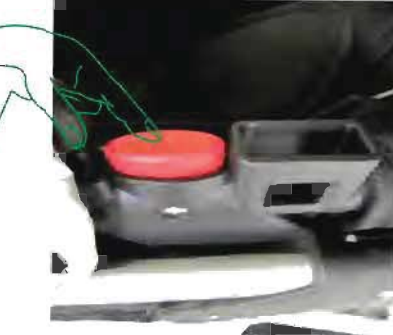
IN ORDER TO REMOVE THE CARRY COT PUSH THE RED BUTTON ON BOTH SIDES AND LIFT THE COT OFF THE FRAME.

IN ORDER TO ATTACH THE CARRY COT PLACE IT ON THE FRAME. MAKE SURE EACH OF THE SIDES OF THE CARRY COT ARE PUSHED DOWN INTO THE OPENINGS.