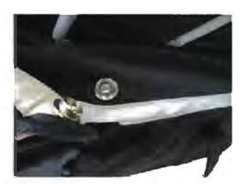
FASTEN TO PRESS STUD