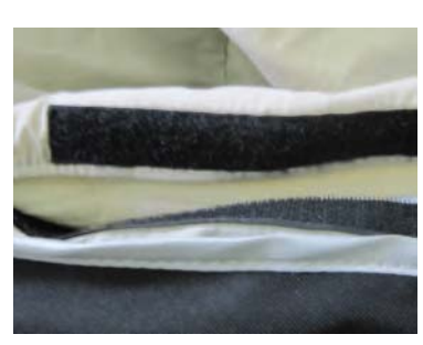
FASTEN THE VELCRO