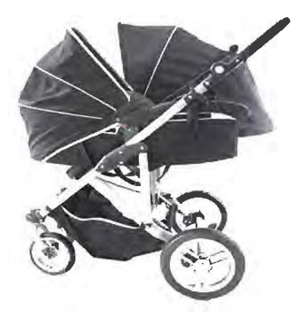
CARRY COT ASSEMBLED