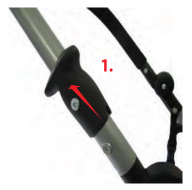
PULL UP CENTRE HOLDER

3. PUSH THE HANDLE DOWN TOWARDS THE REAR WHEELS UNTIL THE STROLLER IS FOLDED.