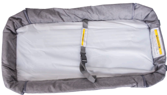
The Assembled changer

Click the handles (6) with the inserted poles (9)