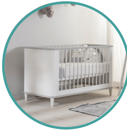
2 Levels Base