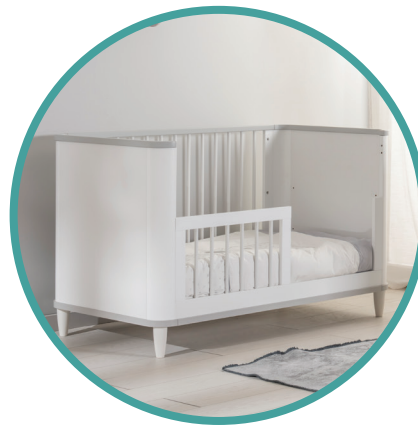
Converts to Junior Bed