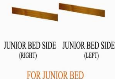
FOR JUNIOR BED