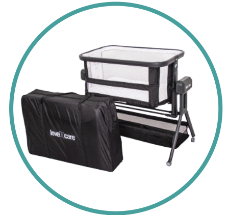
Sleeper and Carry Bag