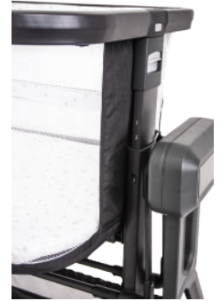
5- Height Levels