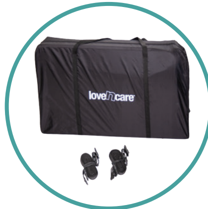
Carry Bag and bed straps